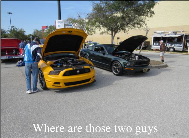
Where are those two guys