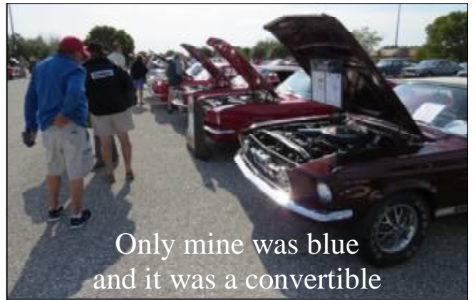
Only mine was blue and it was a convertible