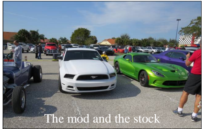
The mod and the stock