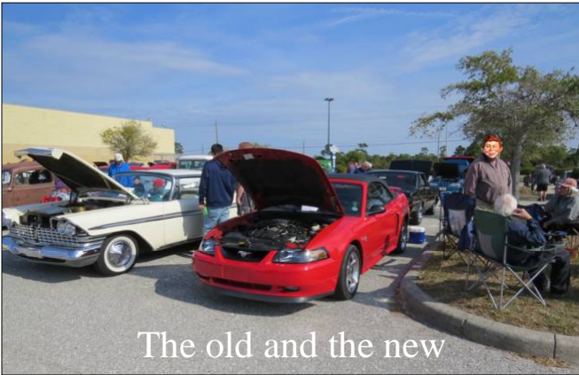
The old and the new